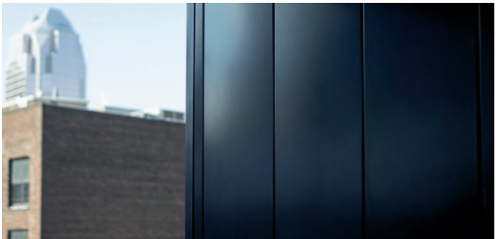
MA-12 AND MA-16 — FOLDED ALUMINUM BOARDS

MAP-03 is an architectural box-style panel entirely built out of durable aluminum and with fasteners that remain visible.