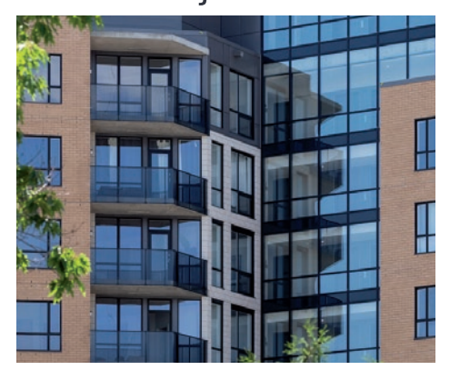
Complexe Città, Saint-Léonard