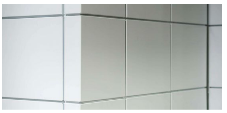
MAP-02 — ALUMINUM CASSETTE-STYLE PANEL

MAP-01 is an architectural panel made out of durable premium aluminum and features a floating appearance thanks to its concealed fasteners.