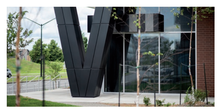
MAP-03 — ALUMINUM BOX-STYLE PANEL

Boasting the reliability of durable construction, the MAP-02 concealed fastener, cassette-style panel is the perfect choice for intricate design. Its thermal expansion-enhanced brackets make it the ultimate go-to solution.